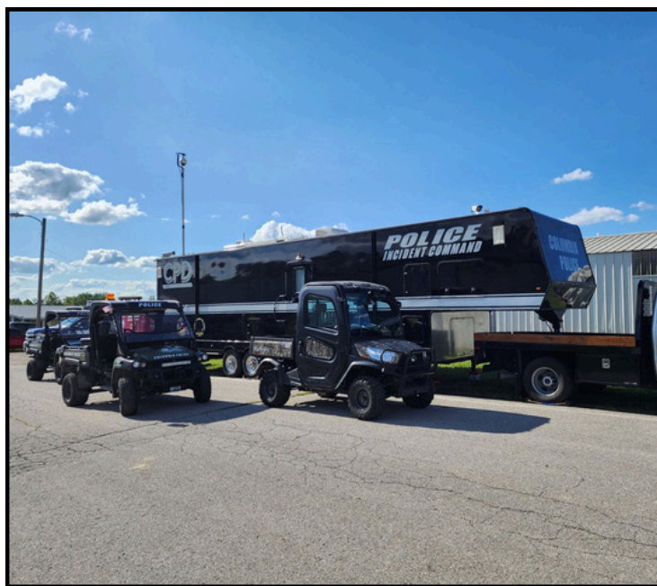
Photo: Command post for the Boone County Fair