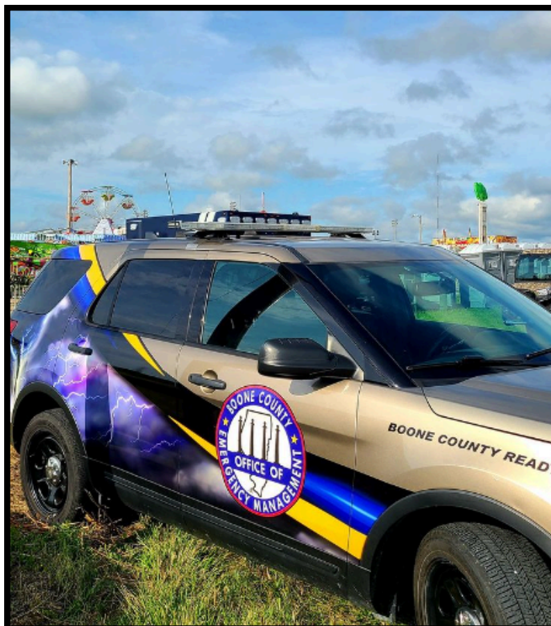
Photo: New Boone County Office of Emergency Management outreach vehicle

To sign up, visit www.Smart911.com to securely share your info with responders.