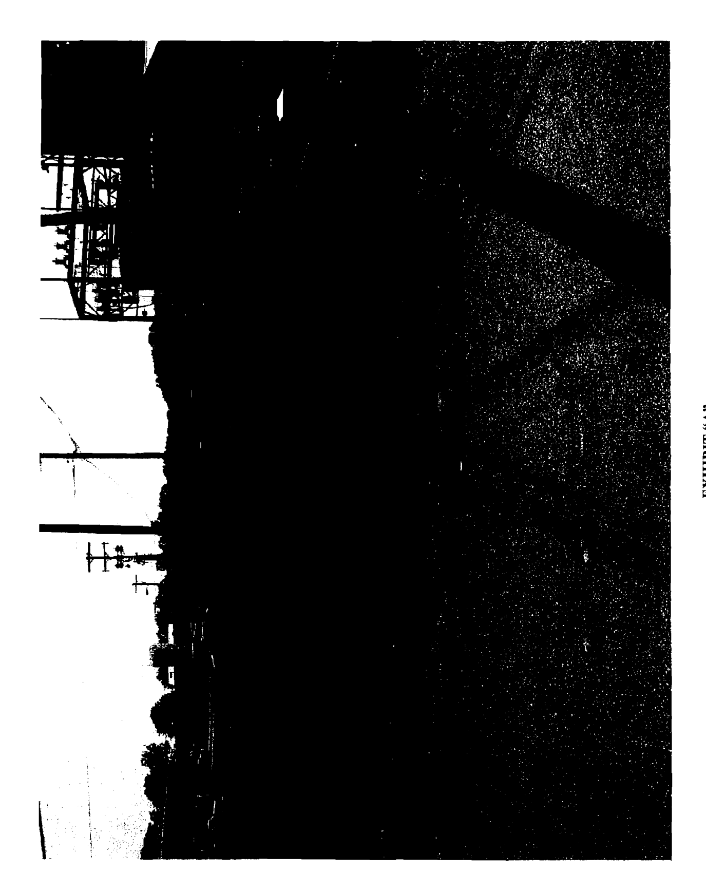
EXHIBIT "A" Card Reader License Agreement Columbia Terminal No. 204