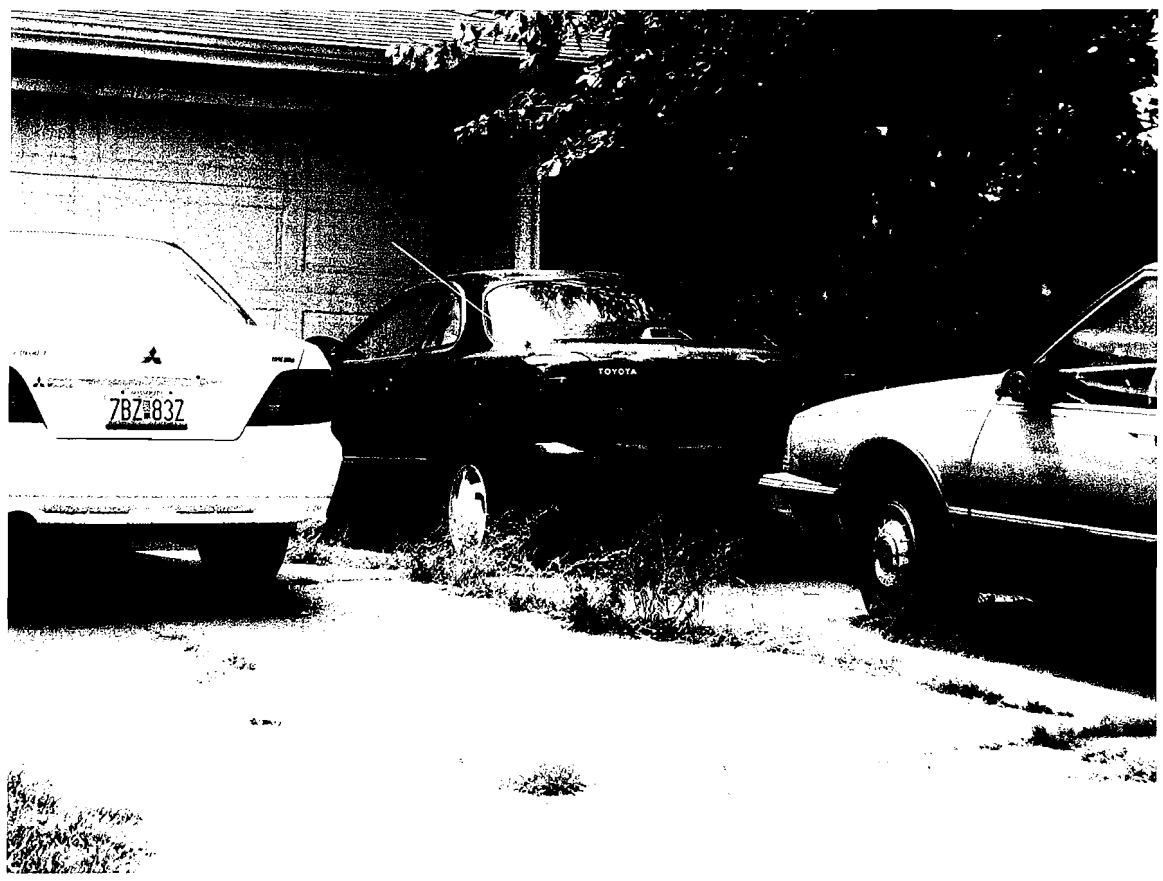
1784 S Sonora Drive Columbia, MO Pictures taken 8/12/08 by Kala Gunier