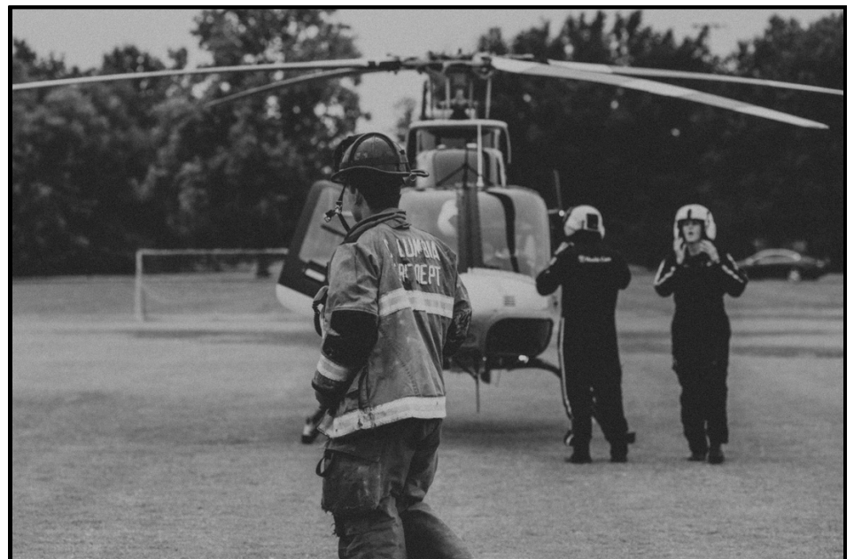
Photo: MU Air Medical staff prepare for takeoff