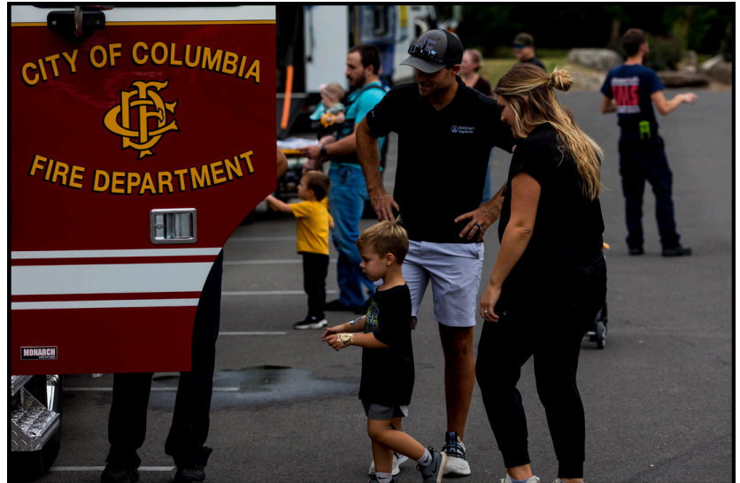
Photo: Festival attendees got to tour many local emergency vehicles, including a Columbia Fire Department fire truck

This free, family-friendly event allowed local emergency responders and preparedness organizations the hands-on demonstrations, educational exhibits, and opportunities to engage with experts.