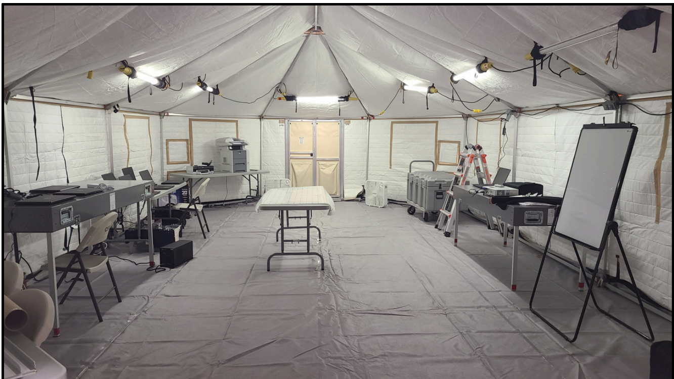
Photo: The shelter fully assembled