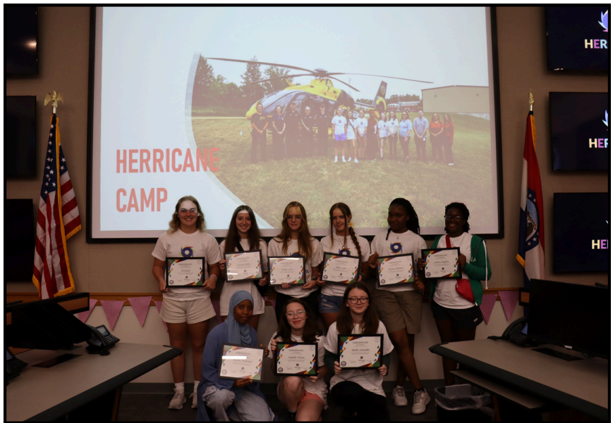
Photo: Group photo of HERricane campers with their Certificates of attendance on graduation day.