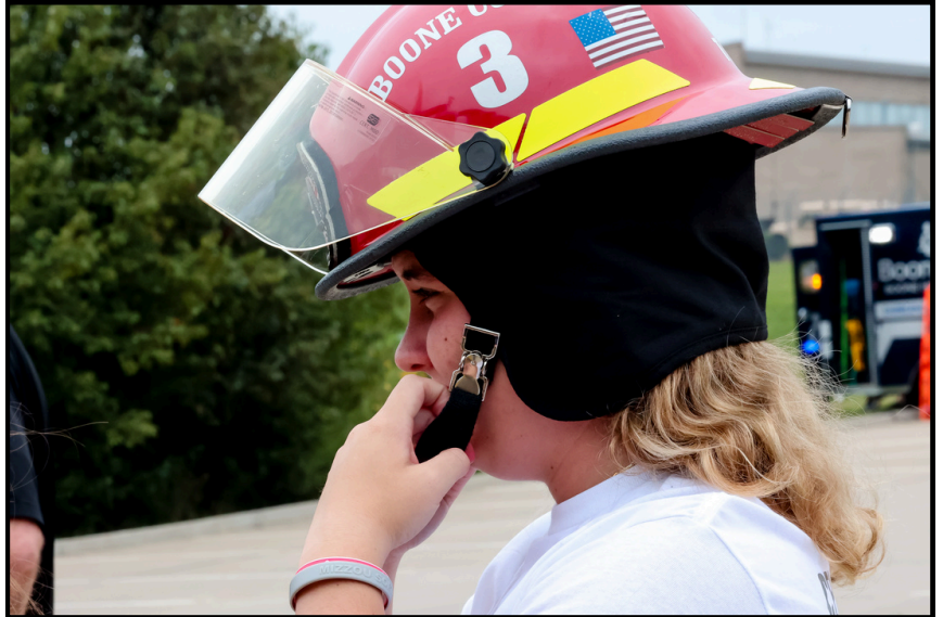
Photo: A HERricane camper learning about our local fire departments during the public safety themed day.

HERricane provided a supportive environment where young women could explore their passions, develop new skills, and build lasting friendships. We are proud to have played a role in shaping the futures of these bright young minds, and we are already looking forward to next year's camp. Thank you to everyone who made this incredible experience possible!