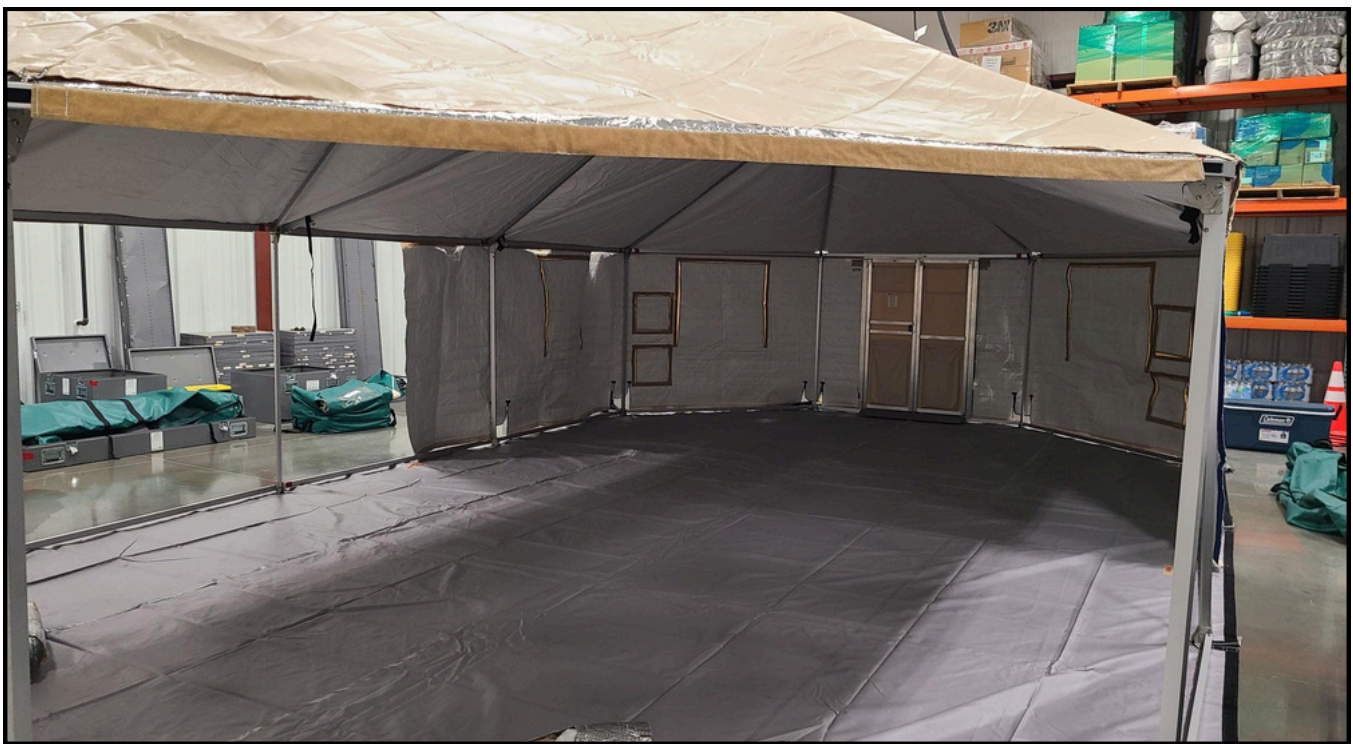
Photo: The shelter partially assembled

The IST cache contains all the tools and equipment needed to construct a temporary emergency operations center the support team could use during a disaster situation, all kept within a climate-controlled Western Shelter tent system powered by a portable generator. Some of the trailer contents include laptop computers, printers and copiers, a Ground Control satellite communications system, tables, chairs, sleeping bags, tents, a portable Honda generator, and all the office supplies a team of twelve would need to operate for the first 12 hours of a disaster. This is a critical asset, not only for our region but also for the entire state.