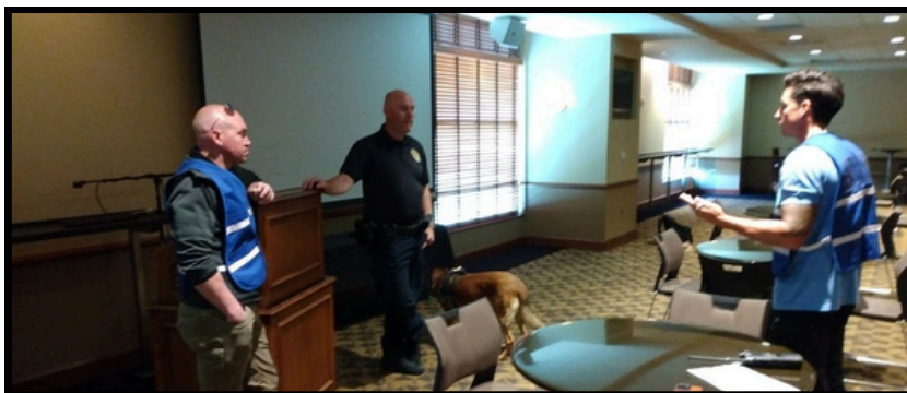
Photo: Bomb dog teams participating in an exercise at the University of Missouri.