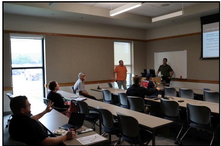
Photo: OEM staff and county employees taking a NARCAN training class hosted by Ashland Police Department.