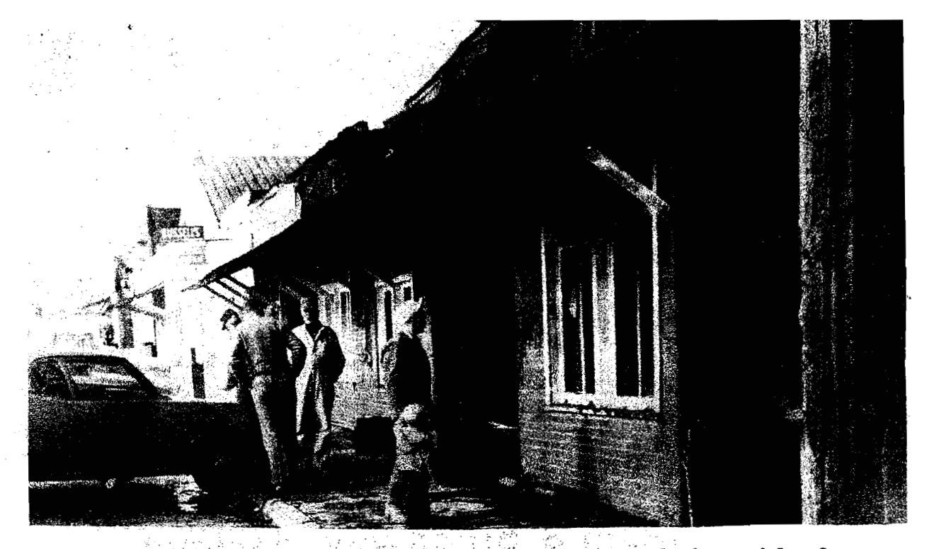
This row of buildings, once the home of the Ashland Bugle, was destroyed by fire in December, 1969. The Boone County Journal made its first home here for nearly a year.